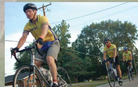
A few of the many sights to see on the RAGBRAI Adventure.